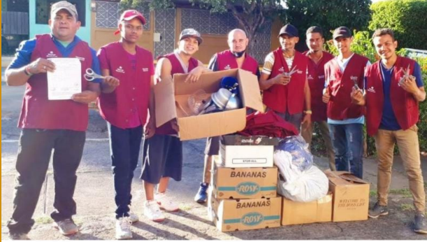
Newly formed W/NP Learning Center group sporting vests from Ministry/Ascension

Next Learning Center meeting at W/NP office in Managua January 26 9am to 1pm