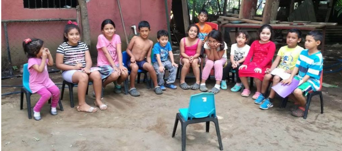
We love the chairs, thank you so much St. Paul Lutheran School in Stevens Point