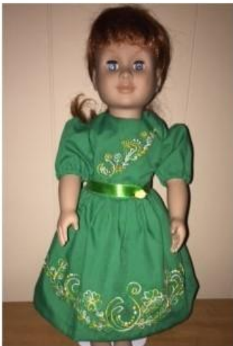
"Sherin" and "Polish II"

The Cultural Commons An Interactive Garden and Education Space